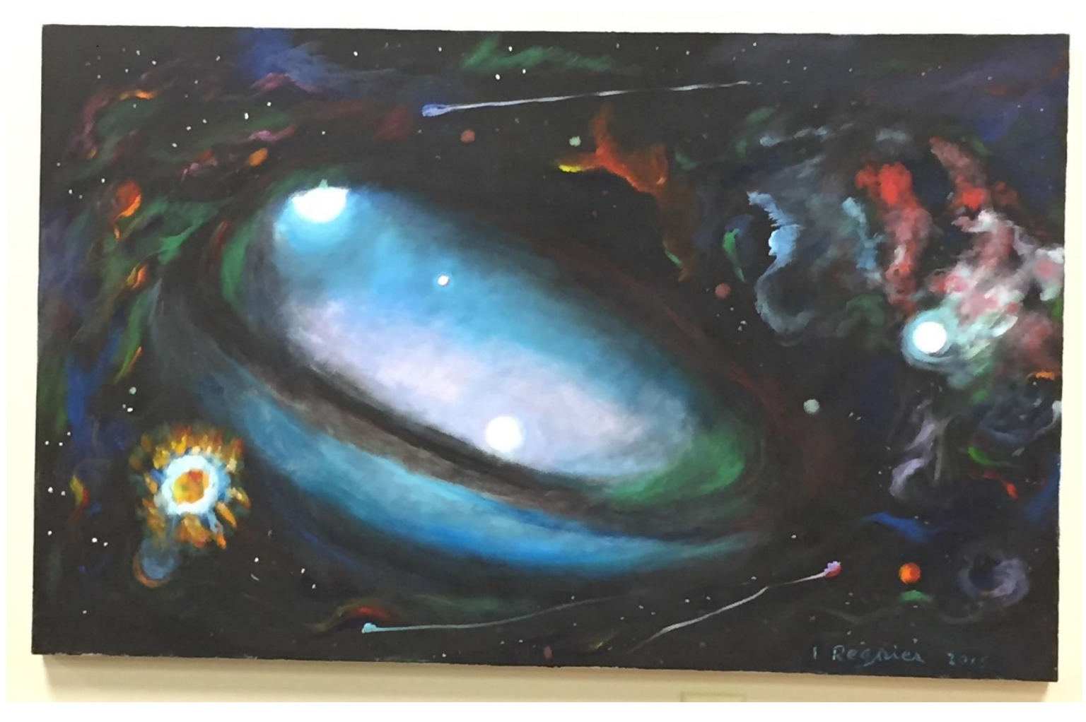
Universe V (2015)