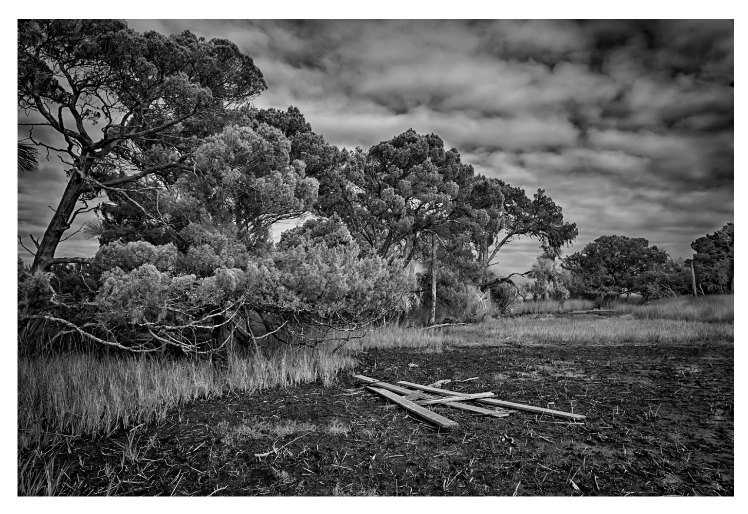
Ossabaw Landing (2014)