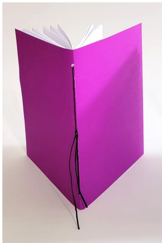
3-hole pamphlet-decorative threads