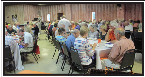
A great time was had by all at the Fall Picnic.