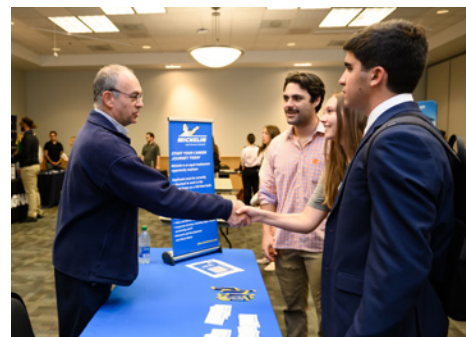
Left and above: Students talk with representatives at the Spring 2023 LAIB Career, Internship, and Info Fair.