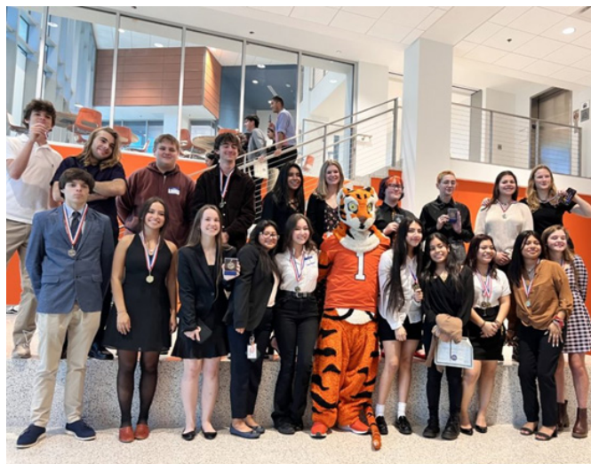
Above: Students pose with the Tiger after participating in the 49th Annual Declamation Contest.

The return to the in-person contest allowed the students, their parents and teachers the opportunity to learn about Clemson University first-hand and participate in campus tours.