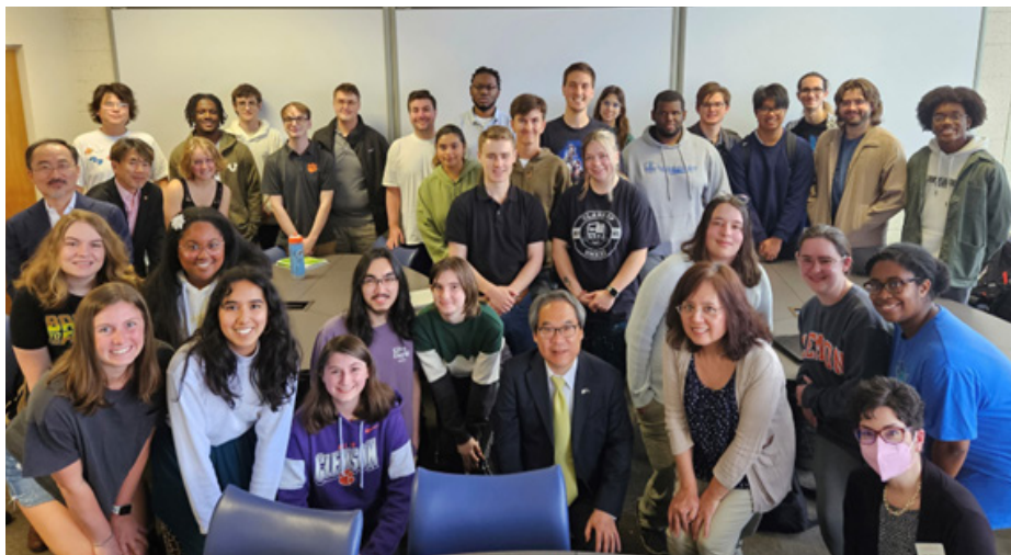
Above: the Consul and Vice Consul of Japan visited a Japanese class, where they spoke with students and answered questions.

The Consul General spoke to the students and answered questions from students in Japanese. The Consul General encouraged students to continue studying the Japanese language and go to Japan to further their study.