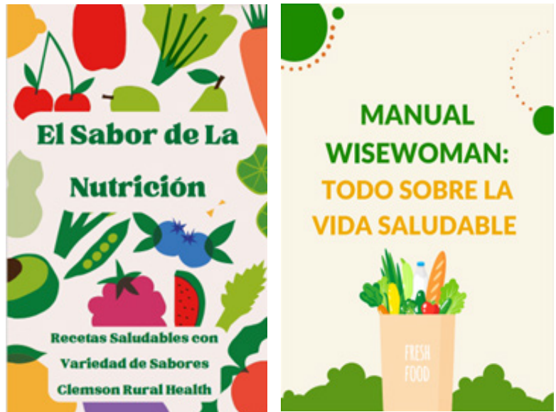
Above: students translated a variety of materials into Spanish, including a healthy-eating cookbook (right) and lifestyle handbook for women (left).

Students also participated in the Clemson Veggie Rx program, which aims to support a healthy lifestyle in the wider community. Students' efforts included distributing vegetable boxes, calling clients and translating both a 60-recipe healthy nutrition cookbook and healthy lifestyle handbook for women into Spanish.