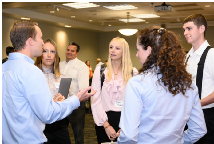
Above: Students of Spanish and German speak with representatives of BMW Manufacturing at the Forum for German and Spanish in Latin American Business.

In October, the German and Spanish sections joined together to hold a Forum for German and Spanish in Latin American Business. This conference highlighting German investment in Latin America gave special focus this year to investment in the Bajío region of Mexico.