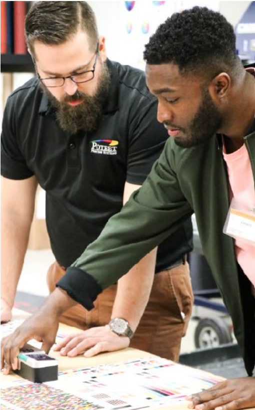
Attendees at the Process Control Seminar

This Fall the Sonoco Institute will host two advanced, speciality courses in flexographic printing: the Process Control for Flexo Seminar on November 6-8 and the Process Color Management Seminar on November 19-21 .