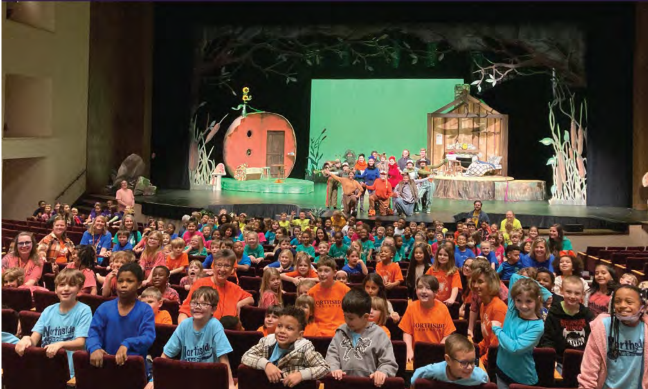
Photo: Students from Northside Elementary pose with the cast after the Tri-ART performance.